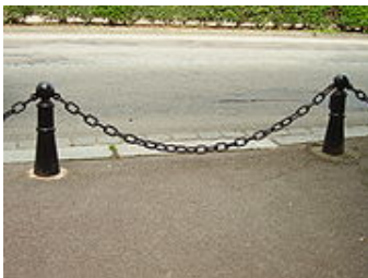
Picture: A hanging chain forms a catenary