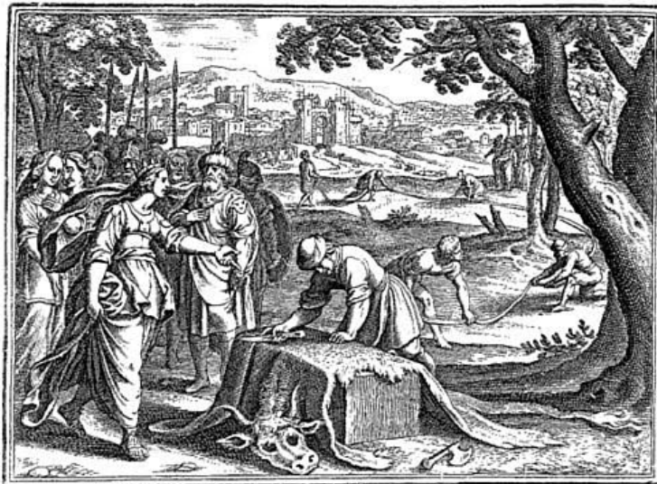
Dido Purchases Land for the Foundation of Carthage. Engraving by Matthäus Merian the Elder, in Historische Chronica , Frankfurt a.M., 1630. Dido's people cut the hide of an ox into thin strips and try to enclose a maximal domain.